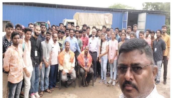
Industrial Visit by Fourth Semester Students