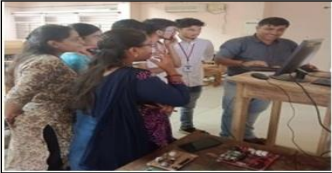
One day Workshop on IOT and its applications using IOT Trainer Kit (Hands on Demonstration) by TMI systems, Bangalore3 rd July 2023.