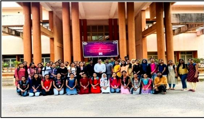
Two days' workshop on "Full Stack Web Development" conducted by Department of CSE in association with ISTE students chapter of UBDTCE4th& 5th June 2022.